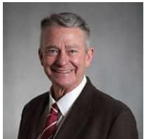
GOV. BRAD LITTLE

GOVERNOR BRAD LITTLE became Governor on January 7, 2019. Brad is an Emmett native who was raised on his family's sheep and cattle ranching operation. He graduated from the University of Idaho in 1977 with a Bachelor of Science in Agribusiness and has worked in the ranching industry for his entire professional life. Brad has a heart for public service. He first served in public office in 2001 when he was selected to fill a Senate vacancy. He was then elected to four consecutive terms to the Idaho Senate. During his service as a Senator, Brad was elected by his Republican peers during his first full term to serve in Party leadership as Majority Caucus Chair. He then served as Idaho's 37th Lt. Governor starting on January 6, 2009. Brad is committed to making decisions through one lens: the lens of ensuring Idaho's children and grandchildren have the best opportunities to stay in Idaho, and for the ones who have left, to return to Idaho. Brad has advocated his whole life for limited government. He works to ensure the lightest possible hand of government in the lives of Idaho's citizens, and he seeks to build the public's confidence in State government.